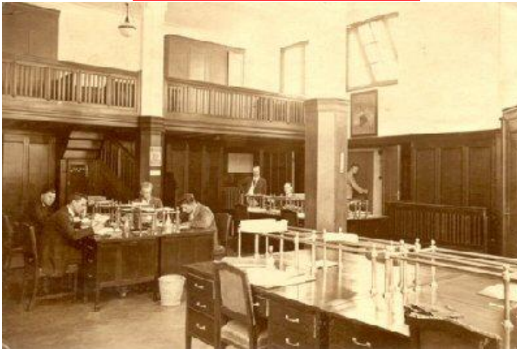
In this office emigrants bought tickets for one of the Lloyd ships, taking them to the South-Americas.

Friday 24, 20.00 hrs to Sunday 26 July, 0.00 hrs restaurant, room 28, party passe-partouts: 35,- euro reservations: http://www.tangomarathon.nl