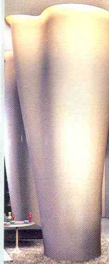
LUX REDUX: LANCÔME

The "French touch" triumphs with the luxurious renovation of the seventy-year-old Lancôme Institute , located on the most privileged of shopping streets in Paris, rue du Faubourg Saint-Honoré. The ground floor houses a luminous beauty-concept store where you can discover the latest in Lancôme products and explore the space's high-tech nooks featuring powerful magnifying cameras to diagnose your complexion. Then traipse over to the makeup artist zone and meet with experts on hand to answer questions and recommend a suitable look for you. Upstairs at the spa, indulge in heavenly treatment sessions (try their fabulous versions of the hot-stone and four-hands massages), tailored to your colour, scent and musical-ambiance needs. — MC